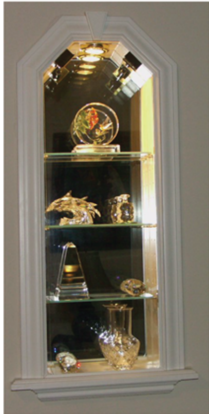
CC-230 depicted here in White Gloss Enamel.